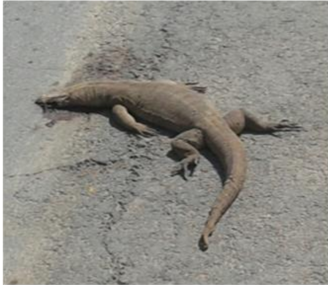
Fig. 1. Lizard killed on Bhalwal Road, Sargodha, Pakistan

Porcupines were killed by traffic due to its habitats were seen around the roads nocturnal way to find out the food and (Fig. 2).