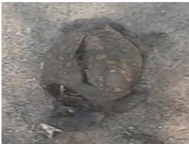
Fig. 3. Tortoise killed on Bhalwal Road. Sargodha, Pakistan.

tortoise were also noticed killed in study time period (Fig. 3).