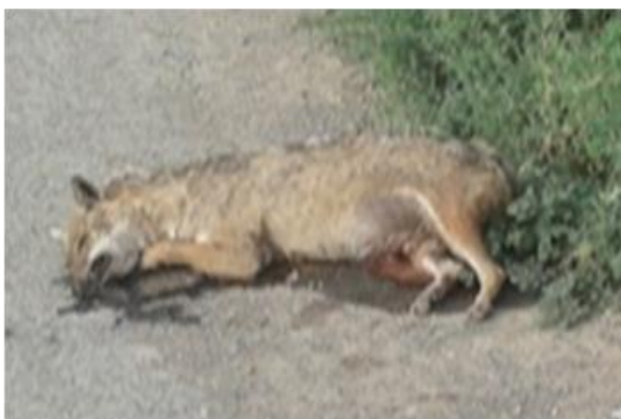
Fig. 4. Jackal killed on Bhalwal Road. Sargodha, Pakistan

Although some seasonal pond had animals in this study duration. Mouse formed by rain. N=145 was the greatest number of killed mammals on the Bhalwal road as compared to other Bhalwal road, Sargodha, Punjab, Pakistan (Fig. 4).