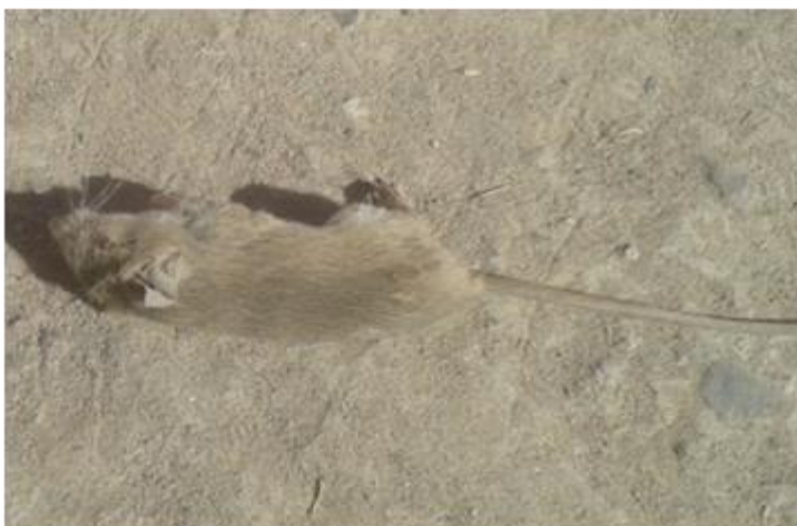
Fig. 5. Mouse killed on Bhalwal Road, Sargodha, Pakistan

It was very important thing on Bhalwal road the mouse or small animals just like that were very rare. This matter might be a low rate of these animals' existence, low numbers of their habitats, low number of their life helping factors. Their counting of killing animals were so difficult due to very small body size as compared to the busses or road traffic. Their body was consumed by microorganisms with very fast and very quick. Five-month data were collected on the basis of road mortality of common wild animals that lived across the Sargodha to Bhalwal road. In April the area of that Bhawal road was