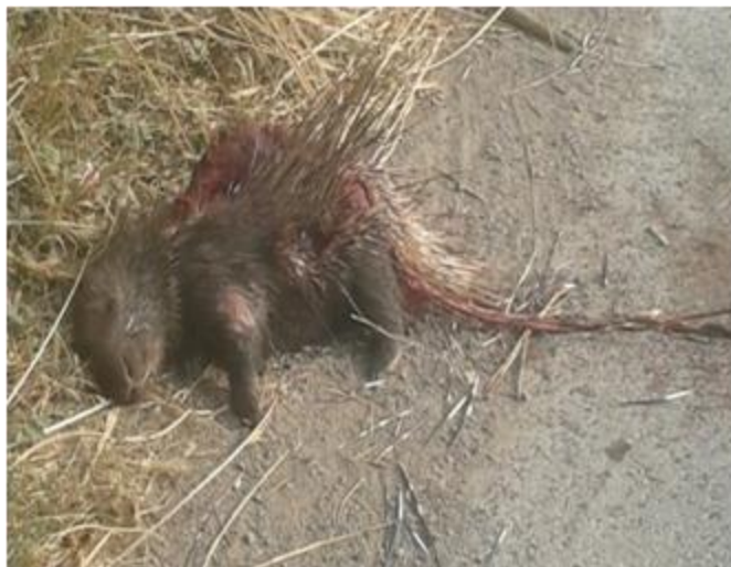
Fig. 2. Parcupines killed on Bhalwal Road. Sargodha, Pakistan

Porcupines were killed by traffic due to its habitats were seen around the roads nocturnal way to find out the food and (Fig. 2).