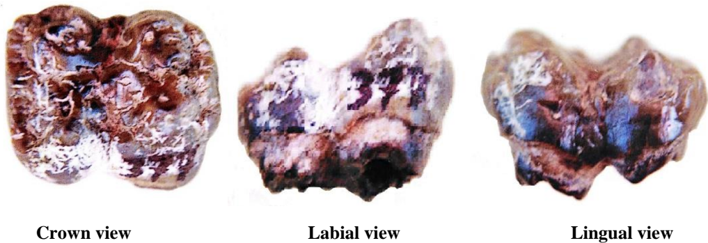
Figure 2. Right upper molar of Conohyus sindiensis recovered from Hasnot

relationship. On the anterior as well as posterior sides of the tooth, a robust multi tuberculated cingulum is present. On the lingual side, it is just slightly weak, and on the labial side, it is virtually entirely no longer there. The crown of the tooth is relatively thin or narrow.